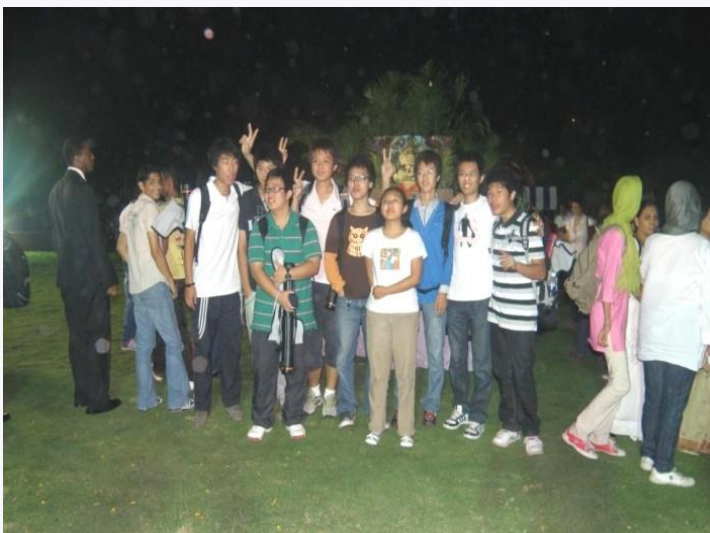
FOREIGN STUDENTS AT JNTUA CAMPUS