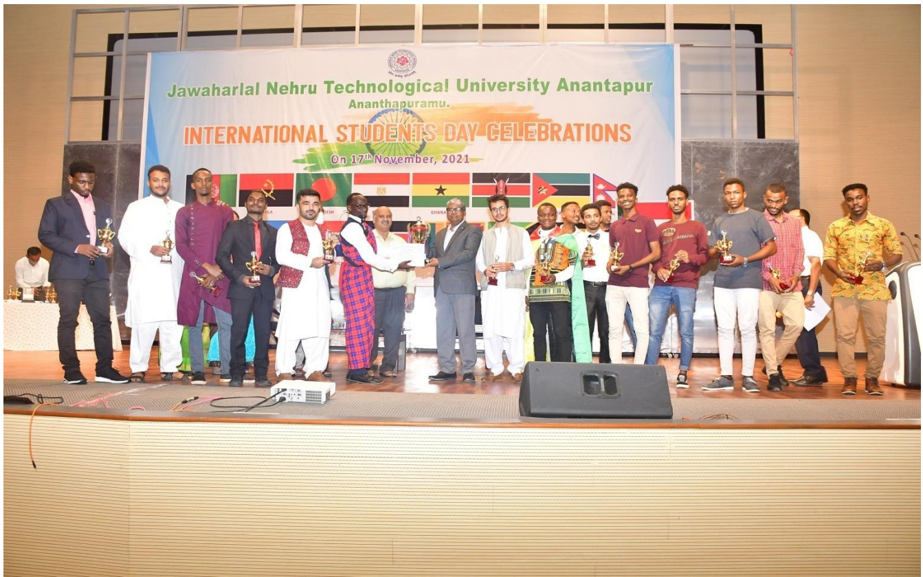
FOREIGN STUDENTS AT JNTUA CAMPUS